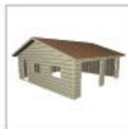
3D Stud Frame