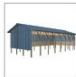
3D Post Frame